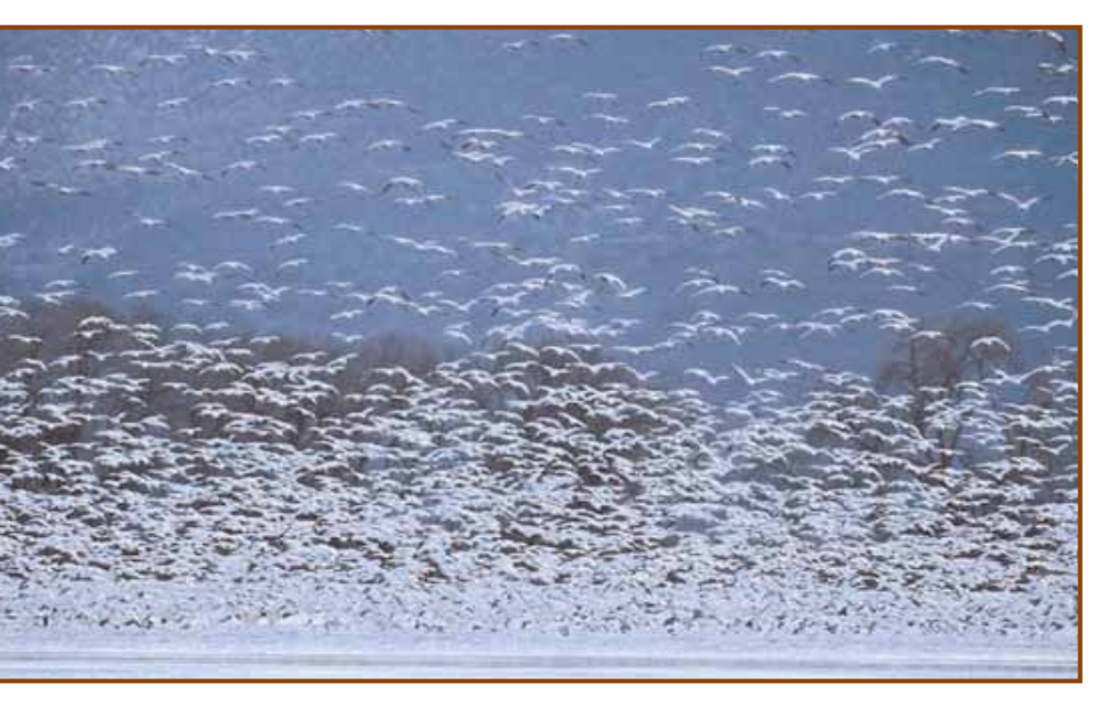
Shown here are Ross's Geese flying over Tule Lake National Wildlife Refuge, California. National Wildlife Refuges across the U.S. harbor hundreds of bird species, sometimes in spectacular numbers, and they generate significant income for local communities through visiting birders. Tule Lake National Wildlife Refuge. California: February 2000.

cessful protection and preservation of native habitats. Governments of less-developed nations, managers of protected areas, NGOs, and birding companies should emphasize birding promotion and education. These entities should also strive to increase the contribution of birding to local communities and grass-root organizations, since birding has a significant potential to generate income through the protection and promotion of natural areas.