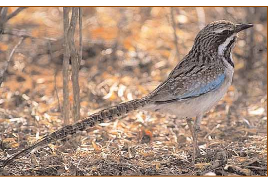
The Long-tailed Ground-Roller ( Uratelornis chimaera ) is only found in the "spiny forest" of southwest Madagascar. A guide named Musa, who had no shoes and spoke no English except for bird names, found this bird and all of the other local specialties of Ifaty in less than one day. Ifaty, Madagascar; July 1998.

areas and who do not benefit from ecotourism are likely to resent tourists and to resist conservation policies. In addition, visited areas can be contaminated by tourist waste, and habitat clearance can result from the construction of buildings and facilities (Weaver 1998).