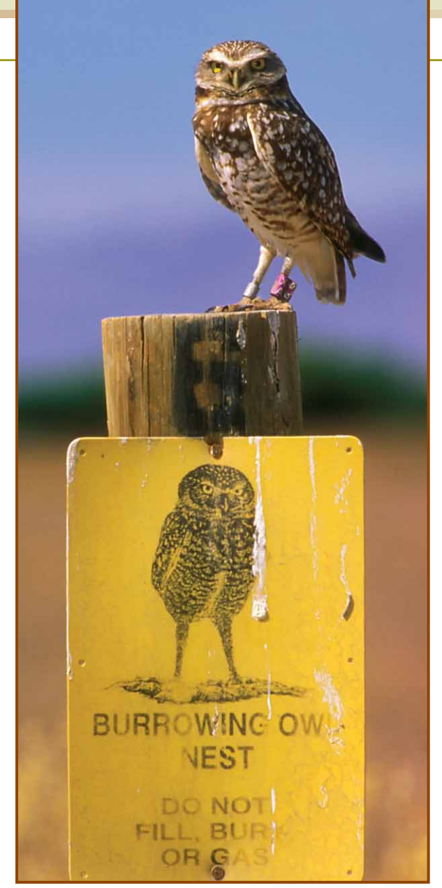
Here is a Burrowing Owl at the Salton Sea. Even though the Salton Sea International Bird Festival is one of the most successful in the country, this site is threatened by the water problems affecting the states sharing Colorado River. Salton Sea National Wildlife Refuge, California; March 2000.

Birders' knowledge of birds and their expectations of seeing many species provide a direct link between avian diversity and local income. Al-