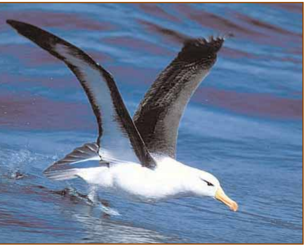
Pelagic birding tours can be an alternative source of income to many fishermen that have been hard-hit by disappearing fish stocks. This Black-browed Albatross was photographed during a pelagic trip off Cape Town. Cape Town, South Africa; August 1998.

sult in the preservation of many areas without official protection. Birds do not pay attention to boundaries, and many species can only be observed outside officially protected areas—at